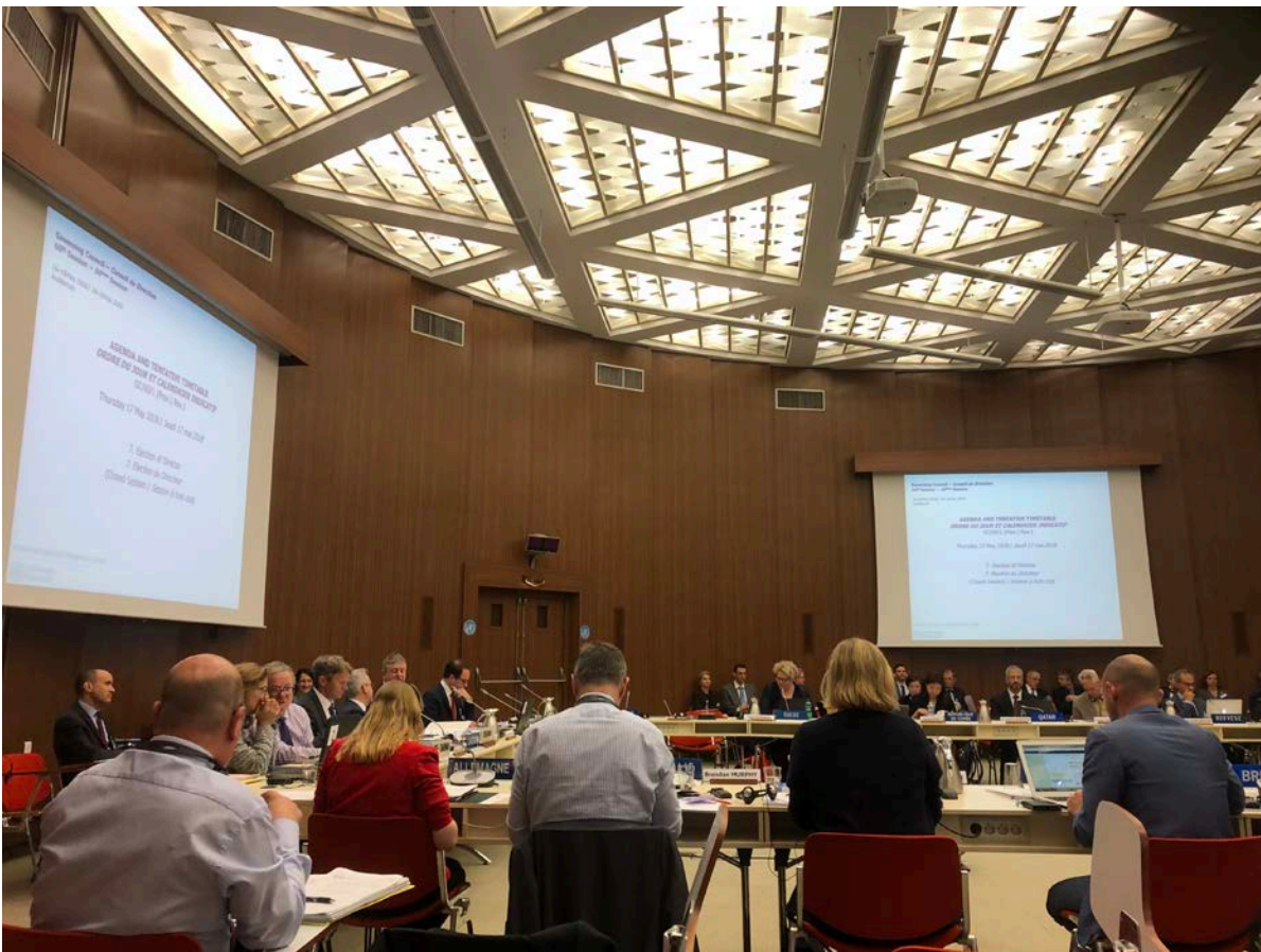
IARC Governing Council – Sixtieth Session