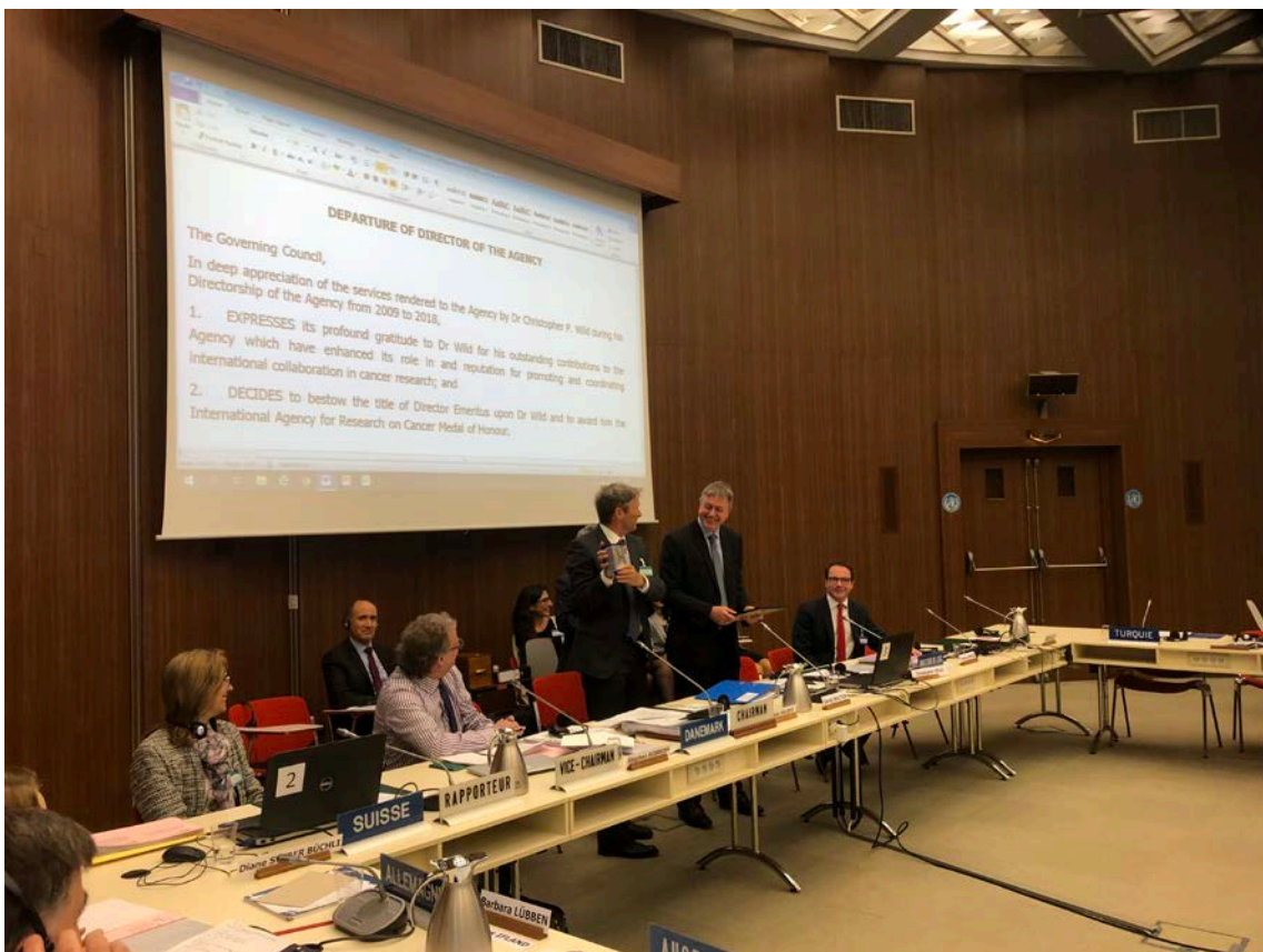
IARC Governing Council (GC) – Sixtieth Session