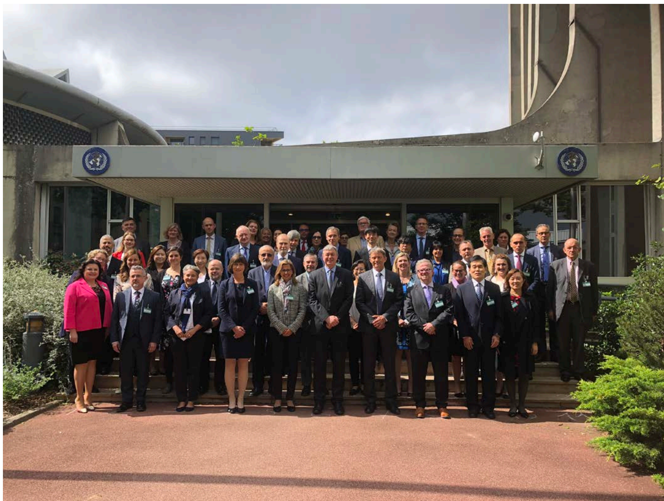
IARC Governing Council – Sixtieth Session Group photograph