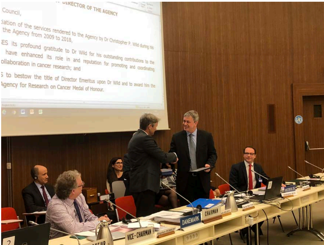
IARC Governing Council (GC) – Sixtieth Session