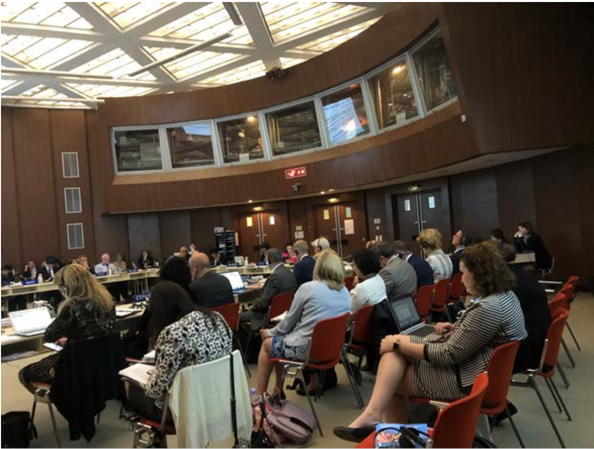
IARC Governing Council – Sixtieth Session