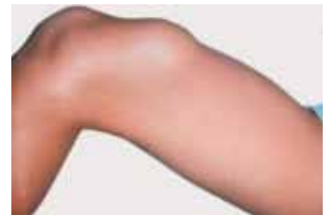
Fig. B.2 Osteochondroma. Hard, smooth, nodular swelling of the distal femur, skin and soft tissues are easily movable and the knee joint is freely mobile.

The clinical features of bone tumours are non-specific, therefore a long period of time may elapse until the tumour is diagnosed. Pain, swelling and general discomfort are the cardinal symptoms that lead to the diagnosis of bone tumours. However, limited mobility and spontaneous fracture may also be important features.