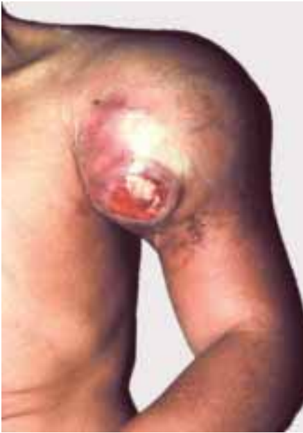
Fig. B.4 Ewing sarcoma of the proximal humerus, presenting as tightly elastic, tense, ulcerated lesion with shining skin, on a grey-white background. Note the marked veins and skin striation.