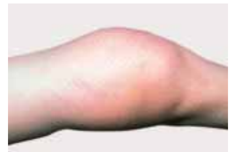
Fig. B.3 Osteosarcoma, causing swelling in the distal femur. Soft tissues poorly movable, consistency ranging from tough to hard, hyperthermia of the skin and marked veins.