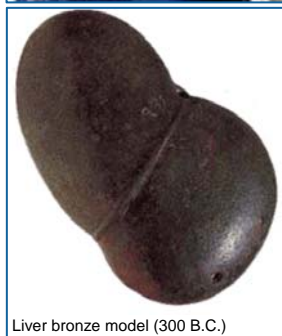
Liver bronze model (300 B.C.)